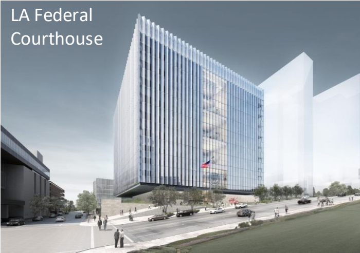
LA Federal Courthouse