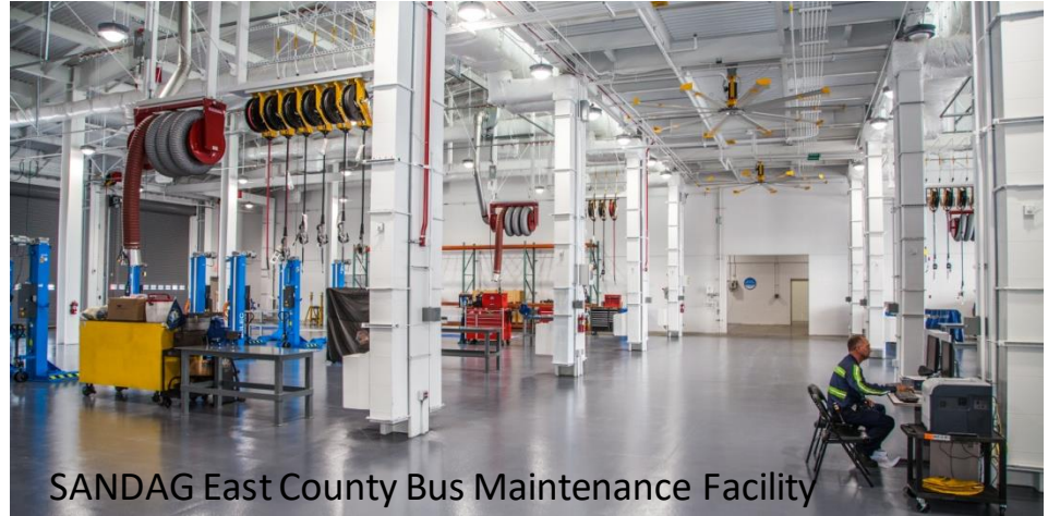
SANDAG East County Bus Maintenance Facility