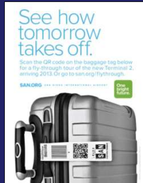
SDBJ “Book of Lists” Advertisement