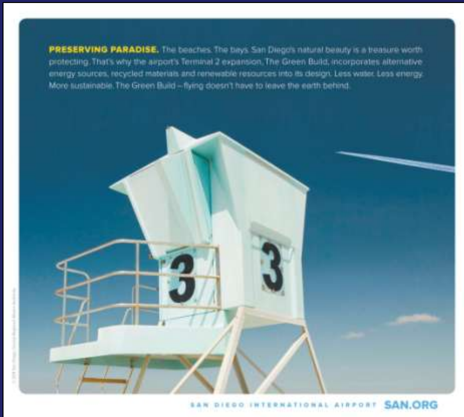
SDBJ “Green Economy” Issue