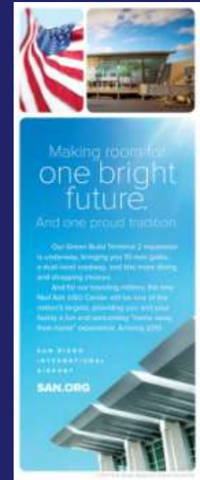
Miramar Air Show Program Advertisement