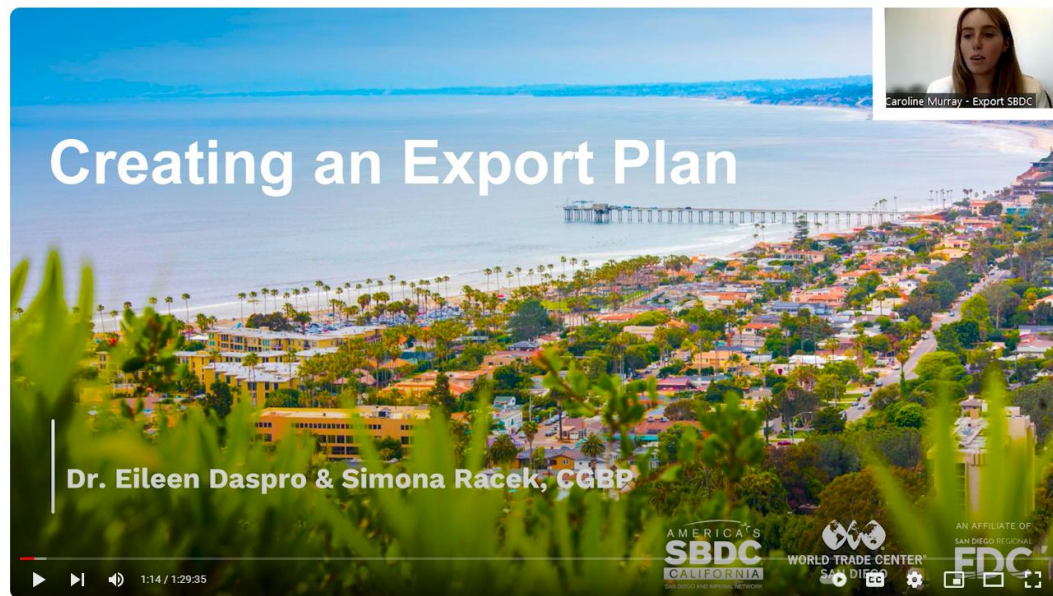
Creating an Export Plan

San Diego & Imperial SBDC Southwestern College 992 subscribers