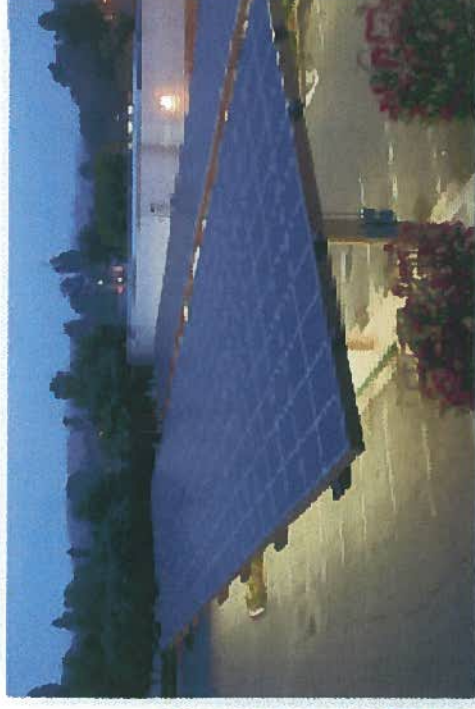
Typical T-structure carport