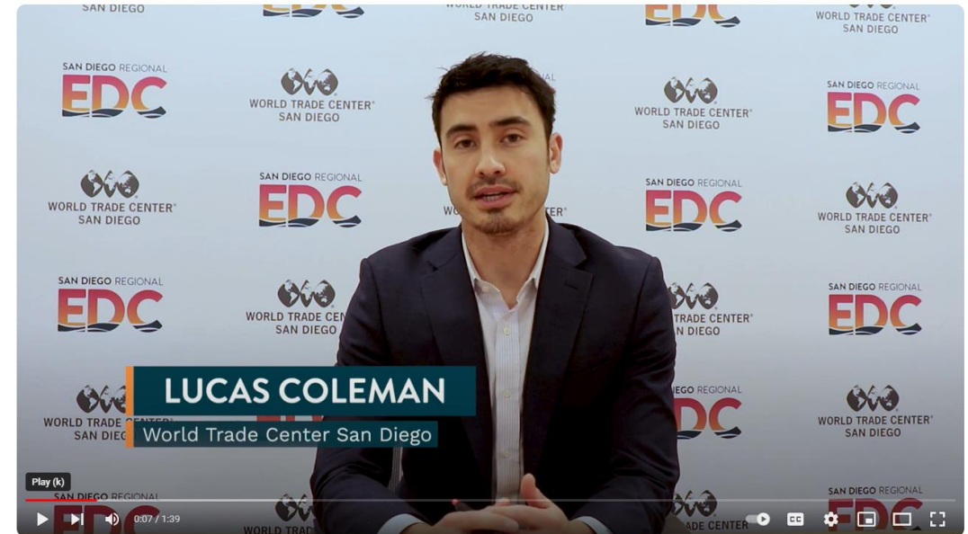
How to Save with Foreign Trade Zones...

0 Like 0 Comment Share Download Clip Save