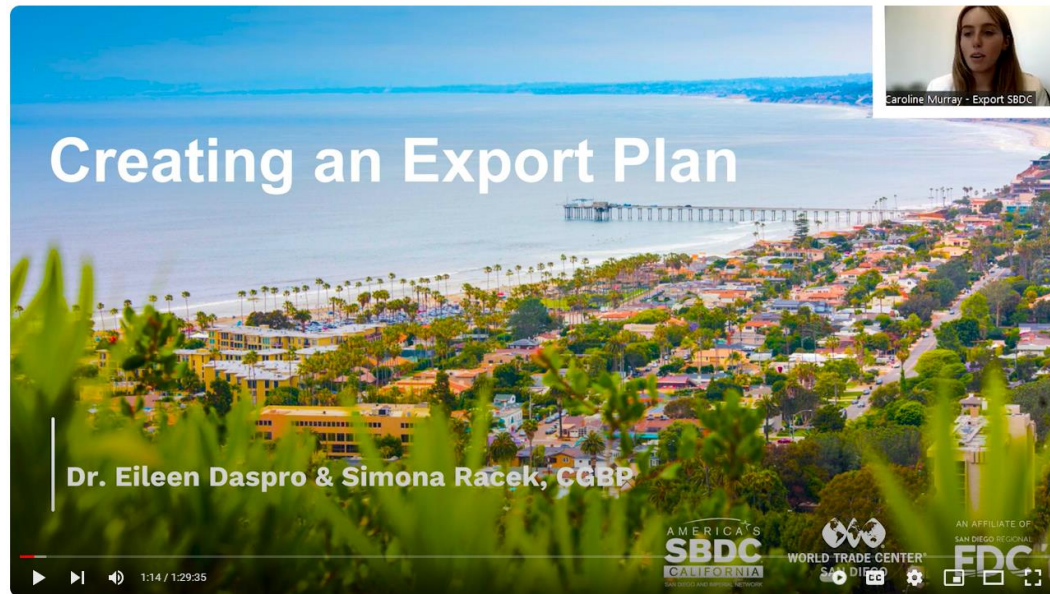
Creating an Export Plan

San Diego & Imperial SBDC Southwestern College 992 subscribers